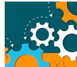
Advanced Manufacturing (Biomanufacturing)