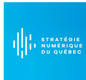
Quebec Digital Strategy