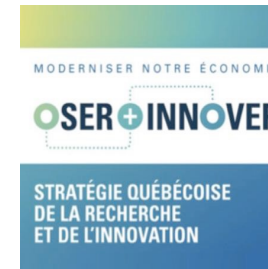
Research & Innovation Strategy